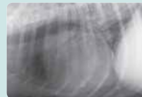
Chest x-ray of a dog with an enlarged heart and heart failure. Specifically formulated cardiac diets are a key part of treatment.