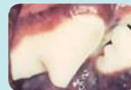
Healthy mouth with white teeth and healthy pink gums